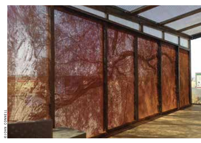
Above: DesertSol, by the University of Nevada at Las Vegas team, used a variety of passive energy strategies, including this metal solar screen, which was rusted to match the home's weathered facade. It doubles as an artwork, embedded with the shadow of a mesquite tree.

Team Capitol D.C., a collaboration of the Catholic University of America, George Washington University, and American University, used Flexinol wire louvers to shade windows on the southern exposure of its HARVEST HOME entry to prevent solar heat gain. Flexinol wire contracts when heated by outdoor ambient air, causing the louvers to close.